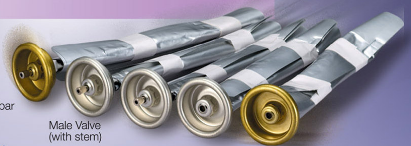
Male Valve (with stem)